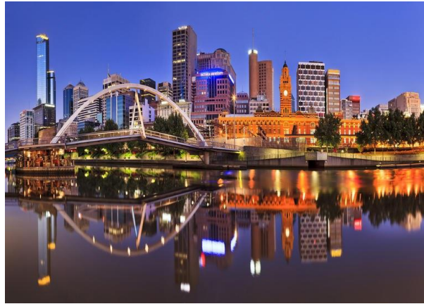
1 - Victoria University, Melbourne, Australia

The 2027 ISSA Congress will take place at Victoria University, hosted at the Footscray and City Tower Campuses, Melbourne, Australia.